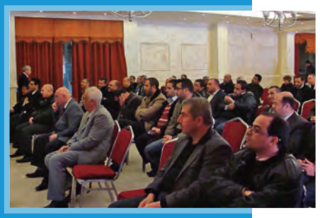
The opening ceremony of the Jordanian Veterinary Poultry Association