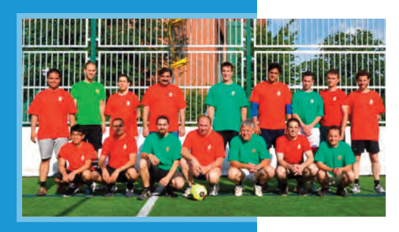
Austrian and Hungarian football teams