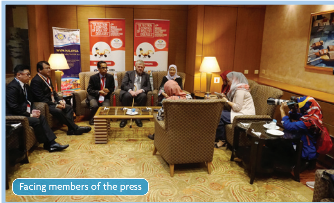
Facing members of the press