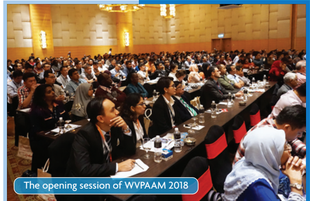
The opening session of WVPAAM 2018