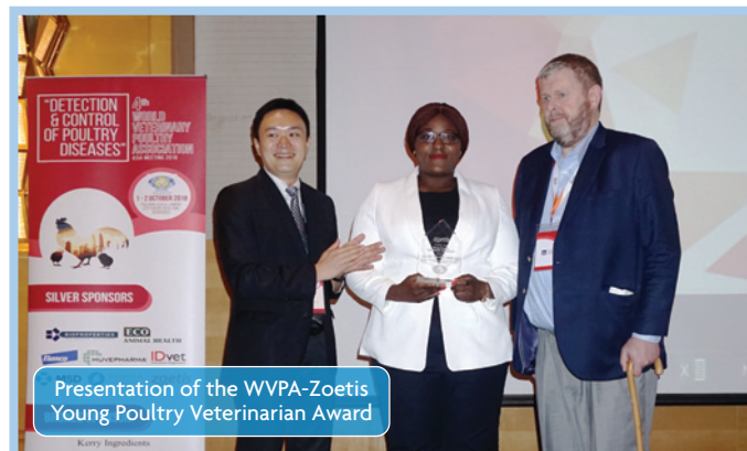
Presentation of the WVPA-Zoetis Young Poultry Veterinarian Award