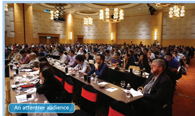
An attentive audience