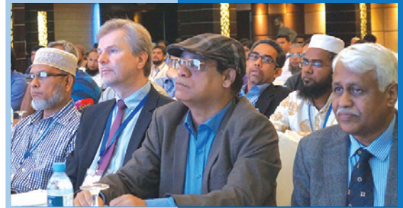
A part of the audience in the symposium on avian influenza vaccination and surveillance