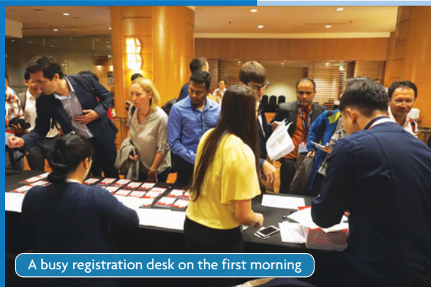
A busy registration desk on the first morning