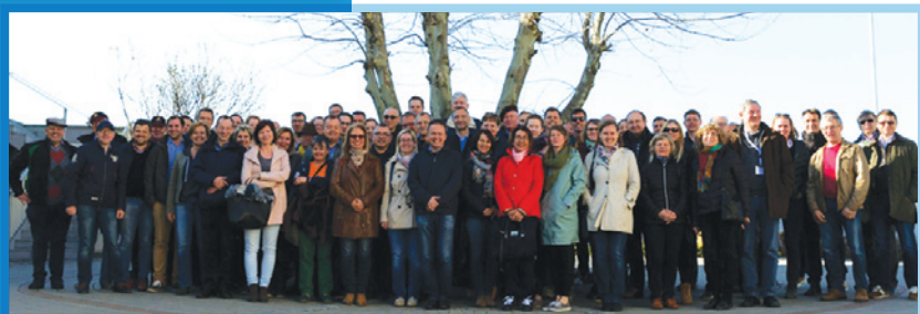
Participants at the annual VAG meeting