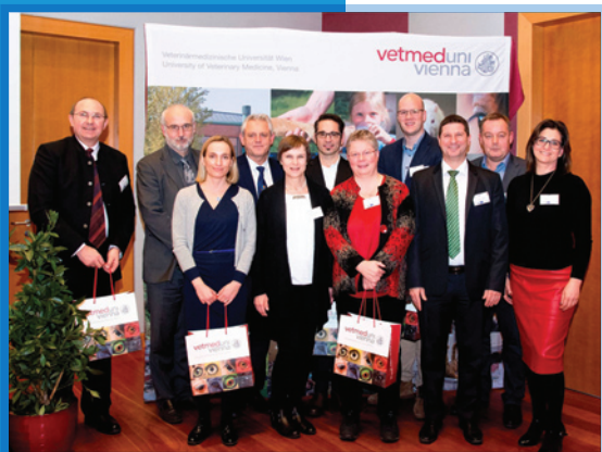
Speakers at the CEPI Conference in Vienna, December 2017