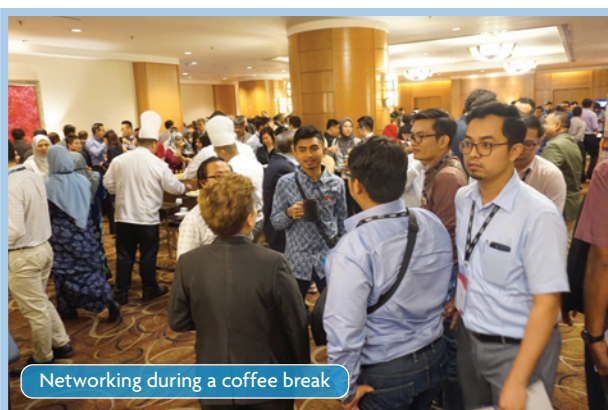
Networking during a coffee break