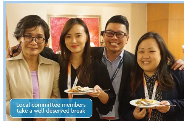
Local committee members take a well deserved break