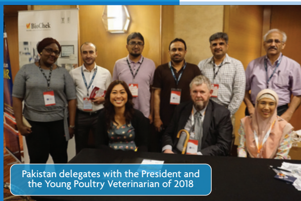
Pakistan delegates with the President and the Young Poultry Veterinarian of 2018