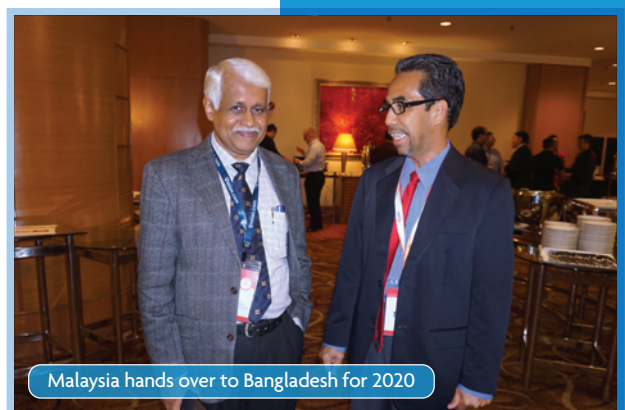
Malaysia hands over to Bangladesh for 2020