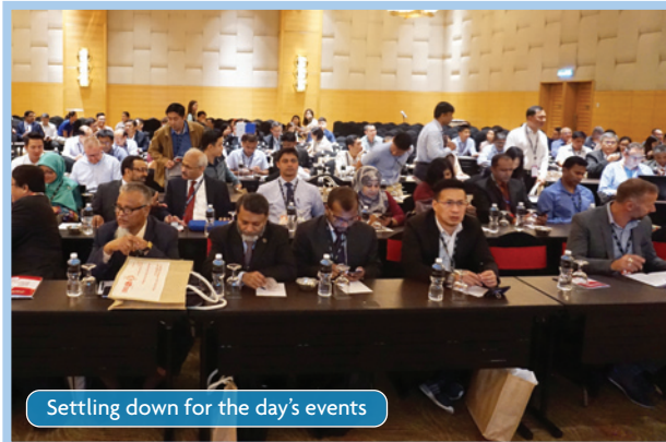
Settling down for the day's events

The Malaysian WPA hosted the 4th meeting in Kuala Lumpur. It was a success with both sponsors leaving satisfied. It was decided that the next meeting will be hosted by the Malaysian Branch in 2022. WVPA Asia is supported by the Malaysian Branch in Manila.