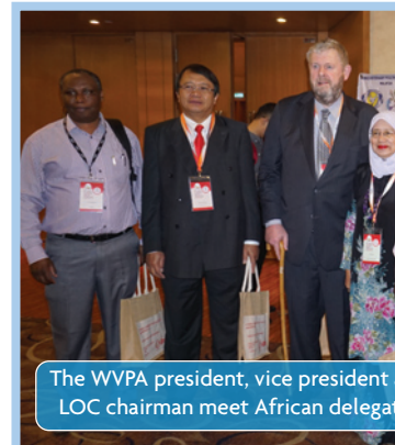
The WVPA president, vice president LOC chairman meet African delegates