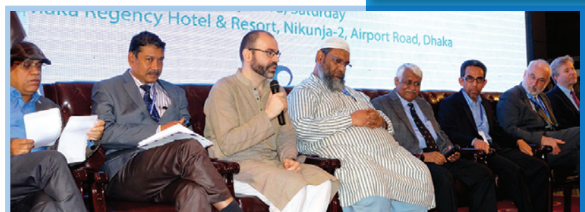
The facilitator and distinguished speakers of the symposium during the Q&A session