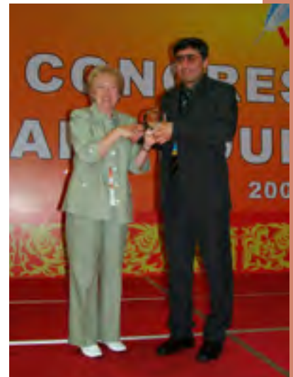
Faculty of Veterinary Science